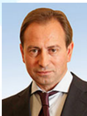
TOMENKO Mykola Volodymyrovych

Chairman of the Supervisory Board of the National University of Life and Environmental Sciences of Ukraine, Doctor of political sciences, professor